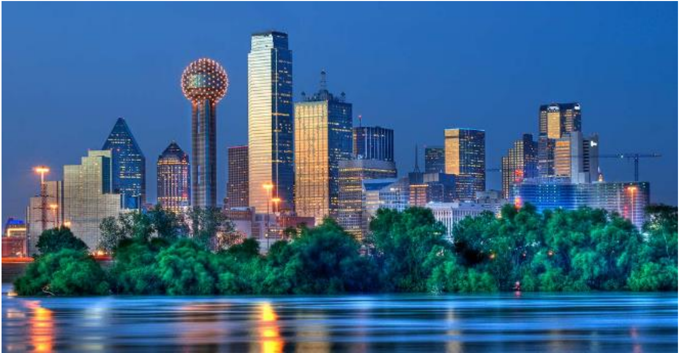
Rand McNally - A Travel Guide to Dallas, Texas