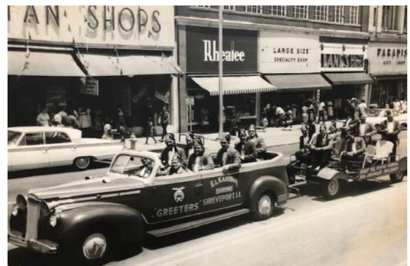
Parade in downtown Shreveport, LA - Studio shoot at KTAL