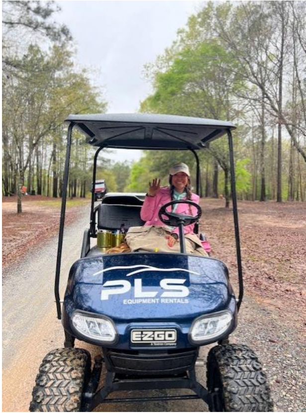
Thanks again to Los Paloma for a wonderful venue.