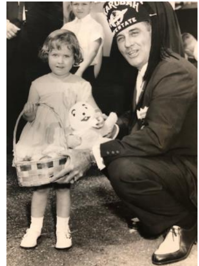
Easter egg hunt, just look at my grandfathers shoes.

Helicopter landing in Shreveport in front of the first Shriner's Hospital built.