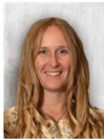
Heather Woods Farmington Club

Central Region Meeting Great Bend, Kansas April 26 – 27, 2024 Registration packets are available.