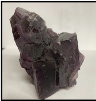
Purple fluorspar - 1989 Region II Mtg