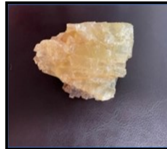
Yellow fluorspar—D&D field trip

My first encounter with fluorspar occurred at another Desk and Derrick event--a Region II Meeting held in Evansville in 1989. At one of the banquets, each person received a sample of fluorspar along with a pamphlet explaining the treasure beside our plate. Here's a photo of my