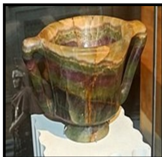
Crawford Cup (Roman, 50-100 CE) In the British Museum Made of fluorite

Although other industrial minerals found in Illinois had higher annual production values, in 1965 the State of Illinois named fluorite as their official state mineral. In Illinois, fluorspar occurs in Hardin and Pope Counties with Rosiclare, Cave in Rock and Elizabethtown being the headquarters for the fluorspar mining industry. When I received my introduction to it in 1989, Southern Illinois was the only commercial producer of fluorspar in the United States. However, fluorspar has also been mined in Arizona, Colorado, Idaho, Nevada, Massachusetts, Iowa, South Carolina, and Kentucky. The last commercial mine in Illinois closed in 1995. Currently, China and Mexico are the world's major producers of fluorite but it is also found in Russia, Brazil, and Spain.