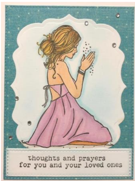
Card designed by Sheryl Cole. Stamped Image Unity Stamps, Co.

Continuing prayers to those recovering from surgery.