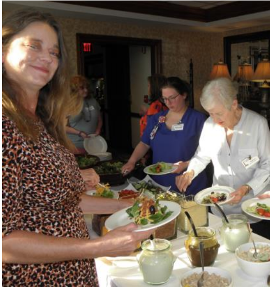
PETROLEUM CLUB BUFFET LINE