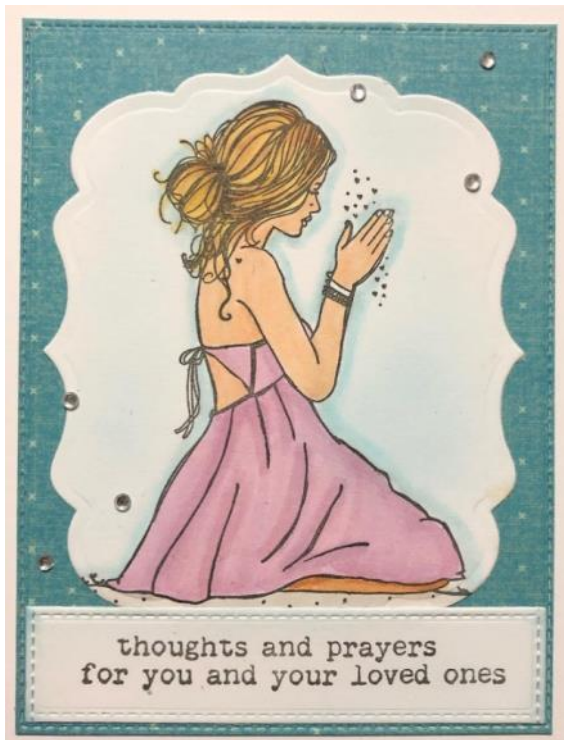
Card designed by Sheryl Cole. Stamped Image Unity Stamps, Co.