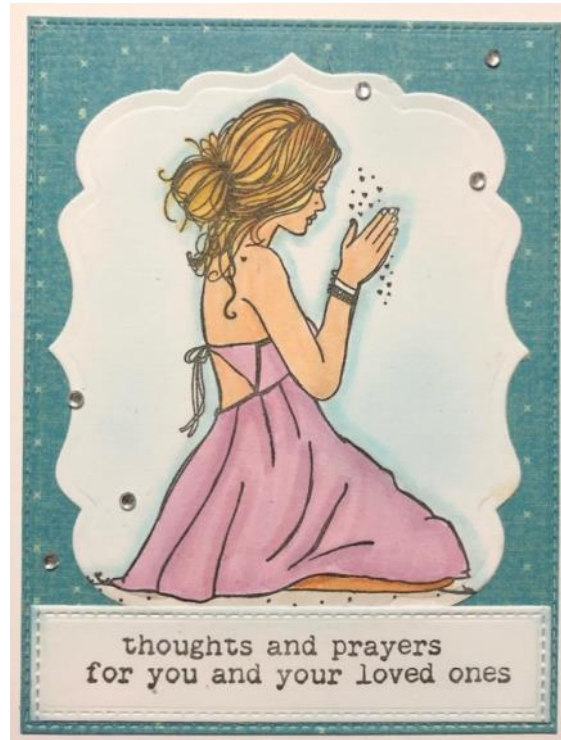
Card designed by Sheryl Cole. Stamped Image Unity Stamps, Co.