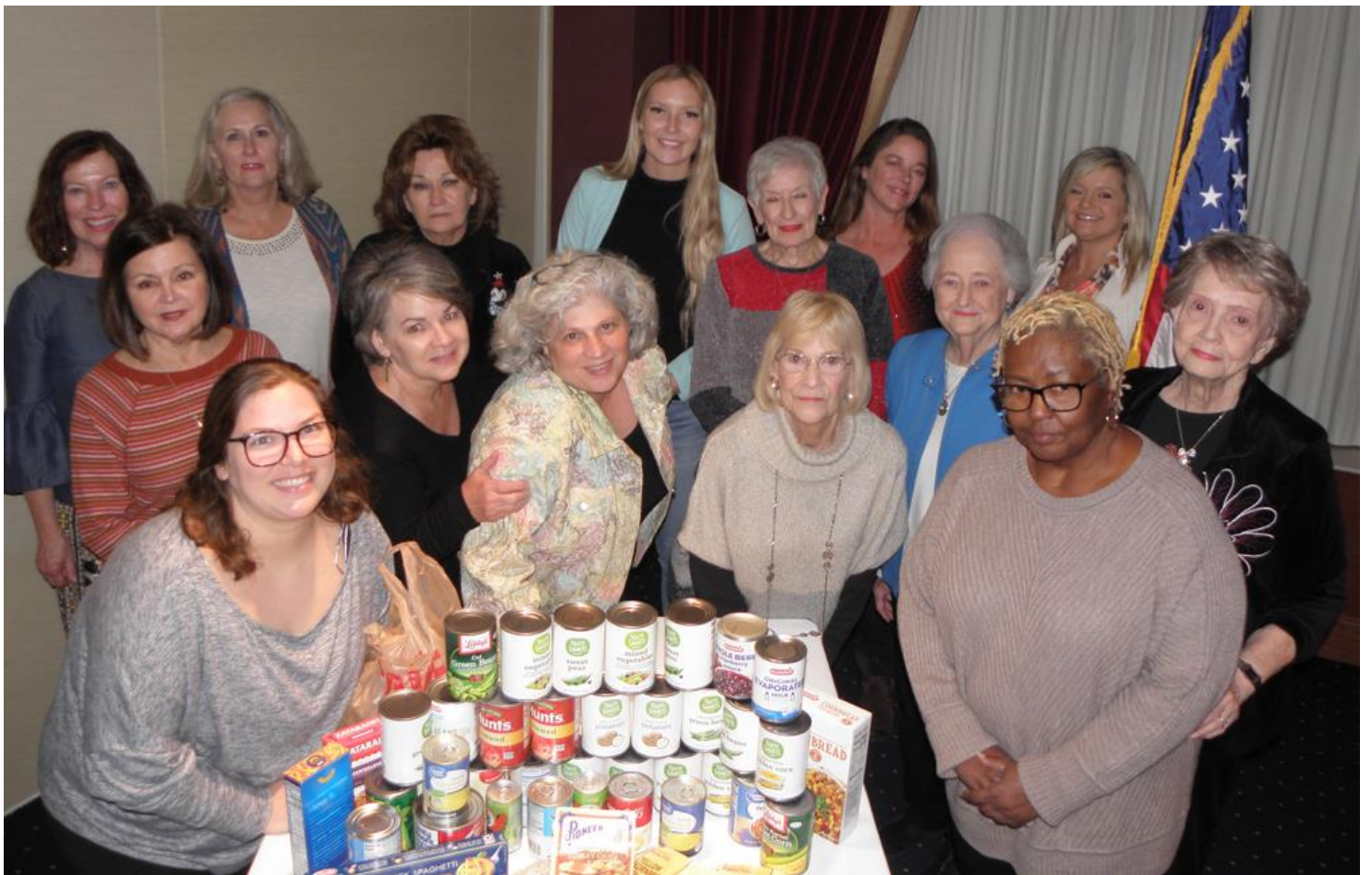
Red River Club members with a small portion of food items. Members collected non-perishable food items for the Caddo Parish Sheriff Deputies 2022 Food Drive.