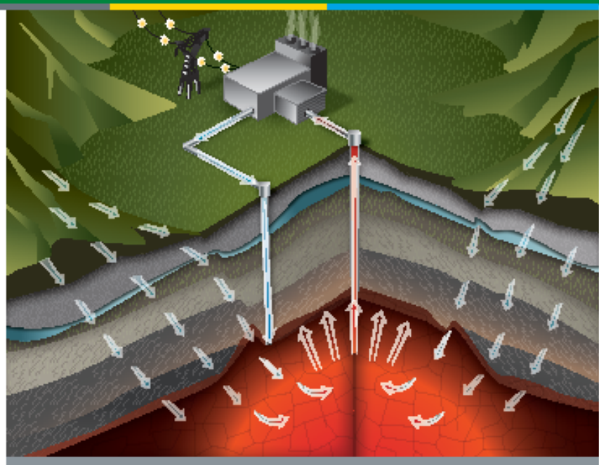
Geothermal energy, accessed through fluid in the hot rocks at a depth up to several miles, supplies a steady flow of high-pressure steam or water to create electricity.

Visit the Geothermal Technologies Office website at geothermal. energy.gov for more information on hydrothermal development, or contact geothermal@ee.doe.gov.